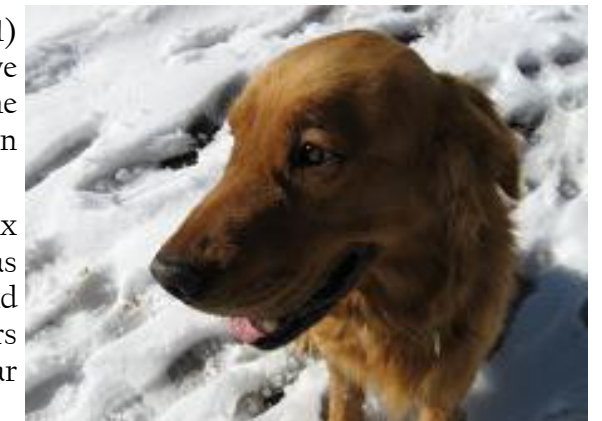
Murphy Hill, enjoying some wonderful Northern Arizona snow!