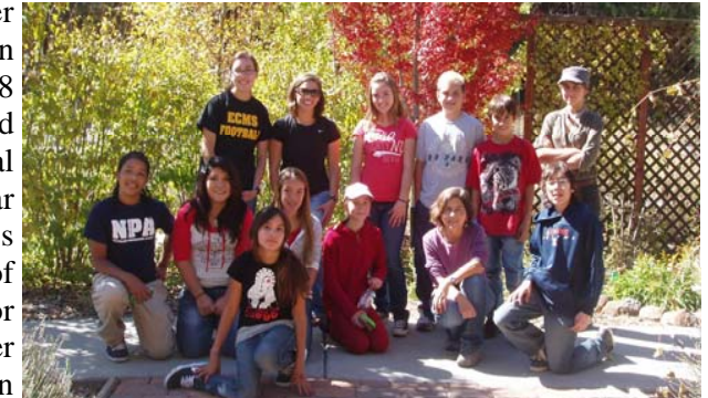
Northland Preparatory Academy helping with the annual Fall Cleanup