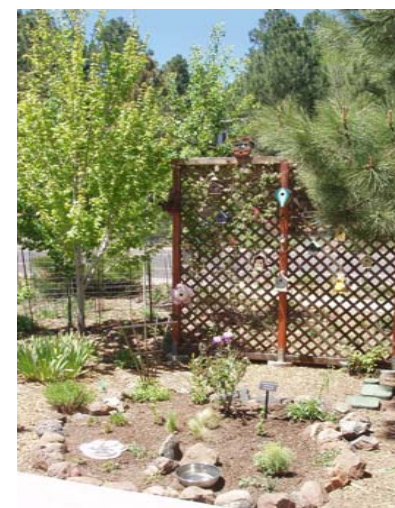
Zane's Garden in June